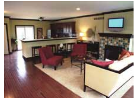
Centurion Place on Ferry Street luxury condominiums in Midtown

“Live Downtown,” a five year, $4 million incentive program developed by Blue Cross Blue Shield of Michigan Compuware Corp., DTE Energy Co., Quicken Loans Inc. and Strategic Staffing Solutions is targeting 16,000 downtown full- and part-time workers.