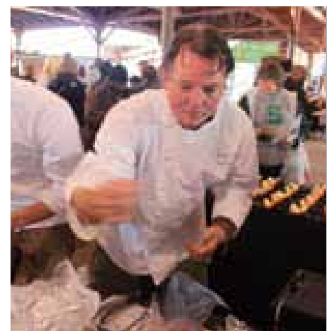
Left to Right: Book Cadillac Culinary Team, Roast Cooks It Up, 24grille Makes A Winning Recipe