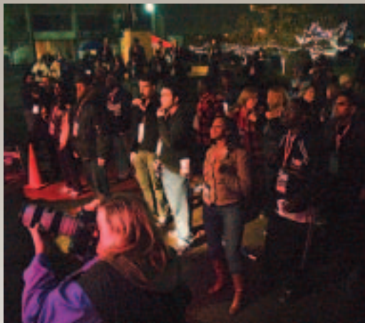
The rain did not keep away the crowd for Access Detroit.

For a complete look of The Westin Book Cadillac Detroit, please see The Detroit News Westin Book Cadillac Detroit Interactive Web Site