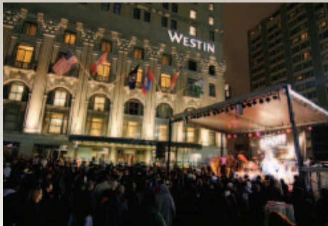
Access Detroit lights up the night to celebrate the new Westin Book Cadillac Detroit.

The $200 million hotel restoration includes more than 60 luxury residences on floors above the hotel and signifies guests will enjoy Detroit's first, and only, hotel-luxury residential project.