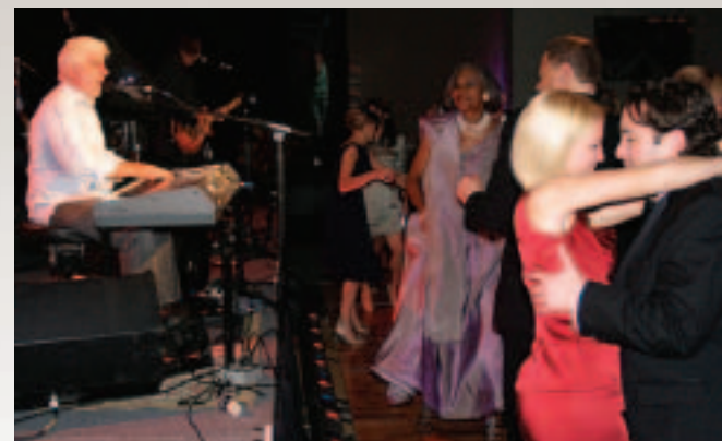
Five-time Grammy winner Michael McDonald brings gala guests to the dance floor.