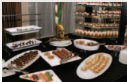
Desserts galore at the gala.