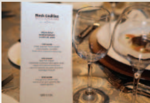
Venetian Ballroom gourmet menu.